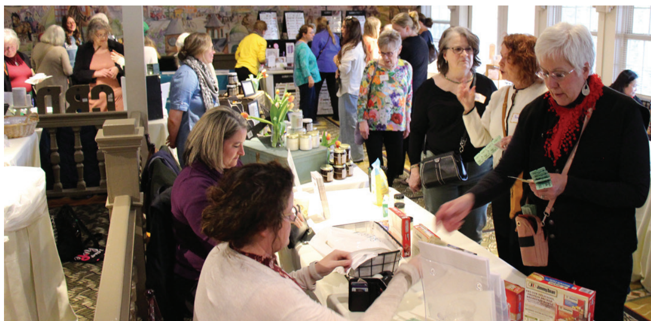
PHOTO: Attendees at Speare's 12th annual Wine, Women & Wisdom event.