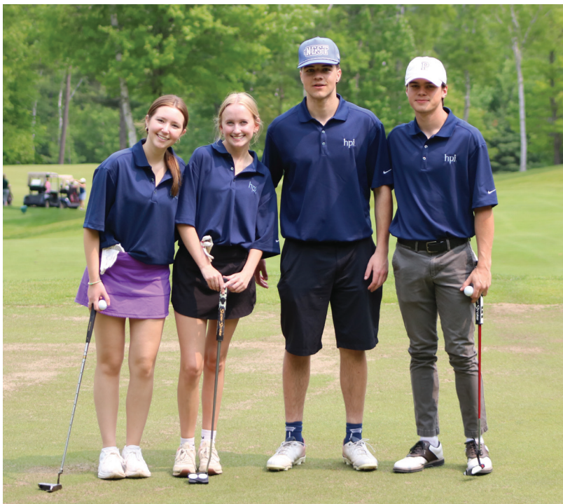
PHOTO: Speare's 27th annual golf tournament raised over $40,000 for the Speare School Dental Program.